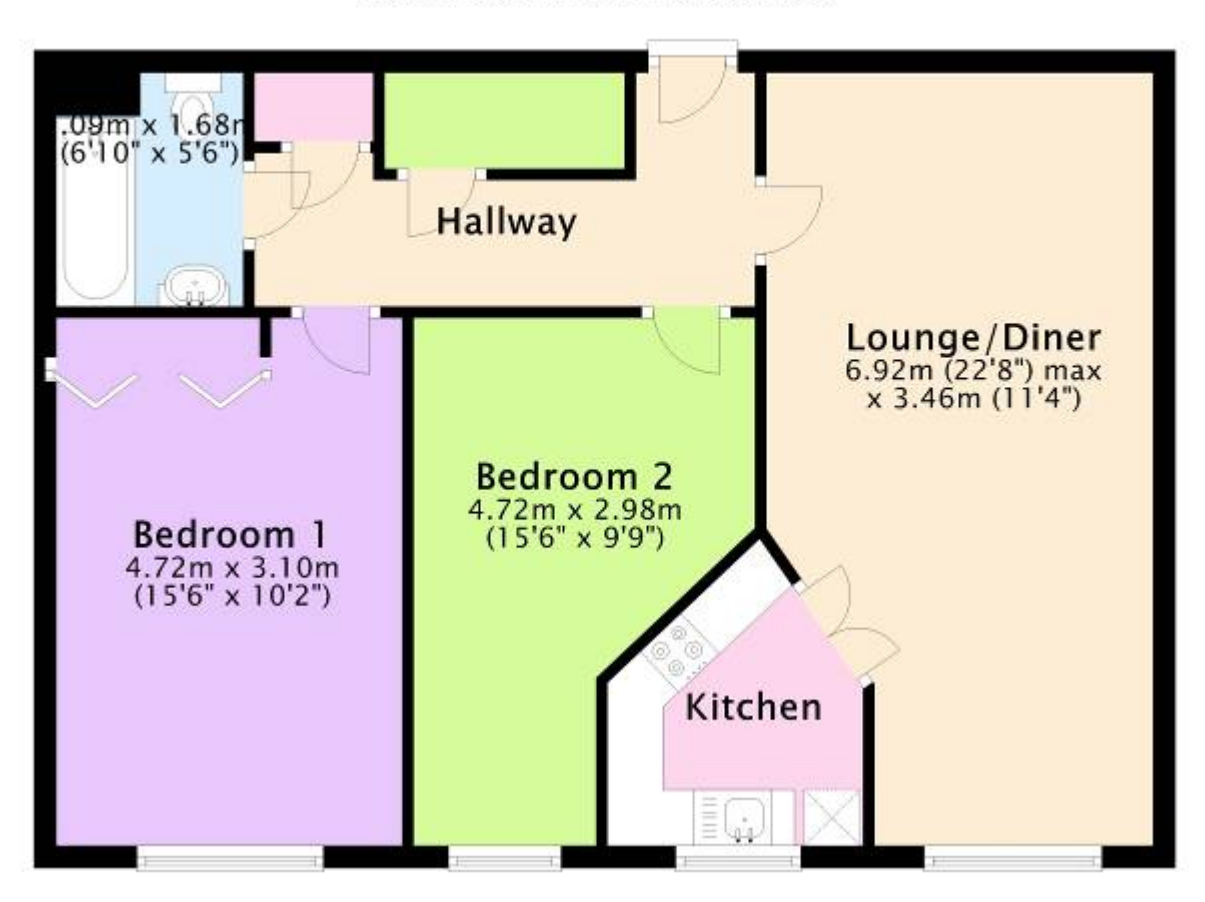
First Floor Approx. 67.9 sq. metres (731.3 sq. feet)