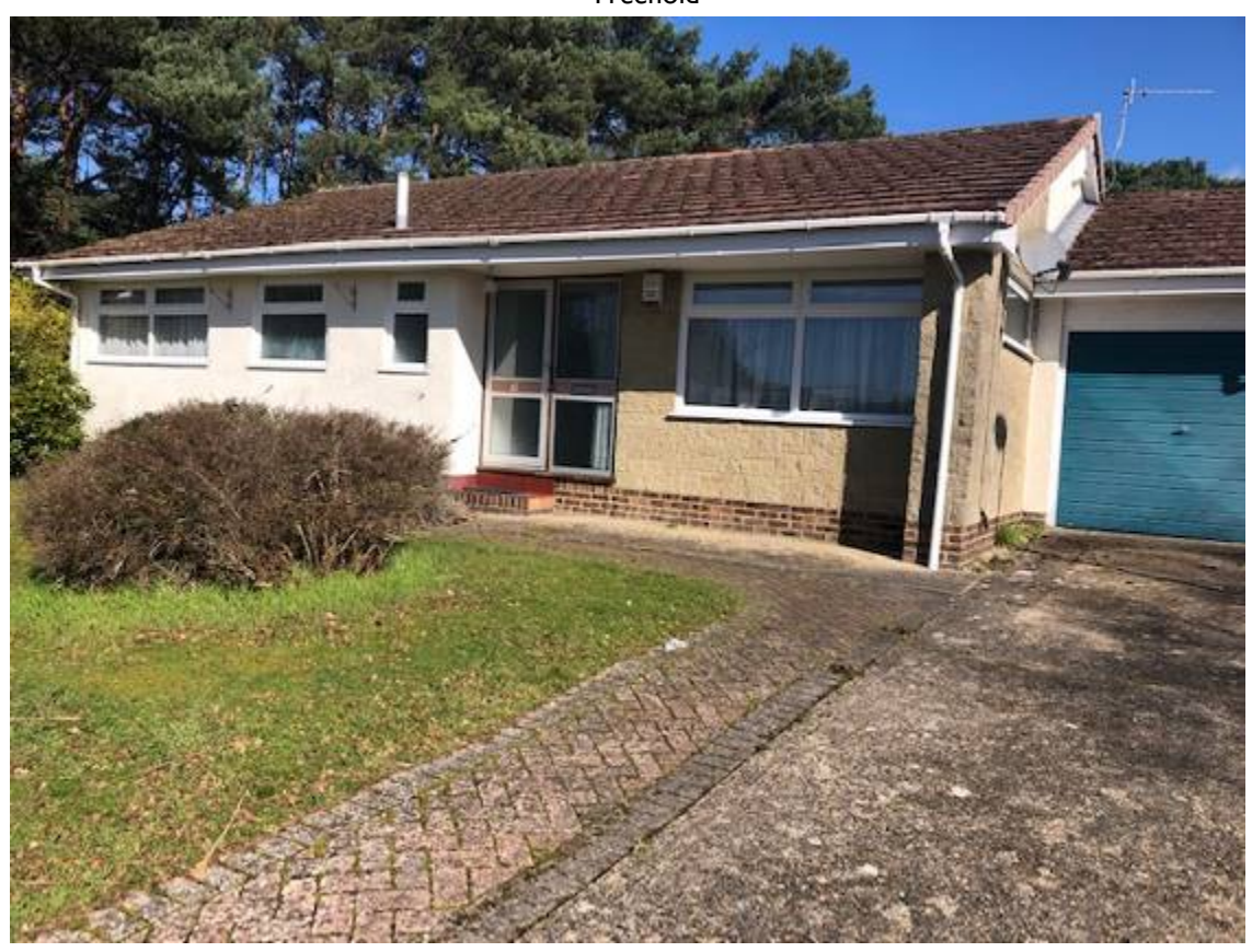
FIRST TIME ON MARKET SINCE CONSTRUCTION IN THE MID 70'S!

BOUGHT OFF PLAN BY THE CURRENT OWNERS THIS TRADITIONAL DETACHED BUNGALOW OFFERS TREMENDOUS SCOPE FOR SOMEONE TO CREATE A LOVELY HOME.