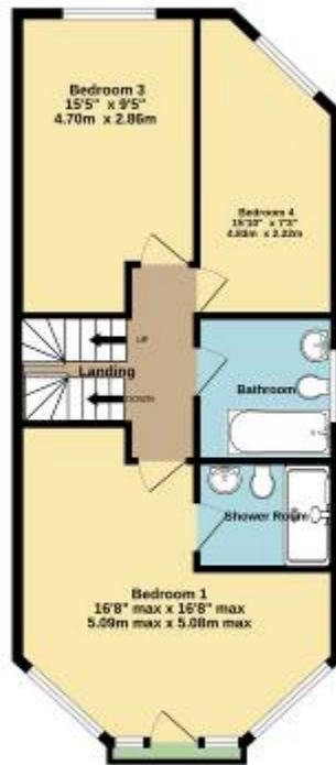
1ST FLOOR 802 sq ft (74.9 sq m.) approx.